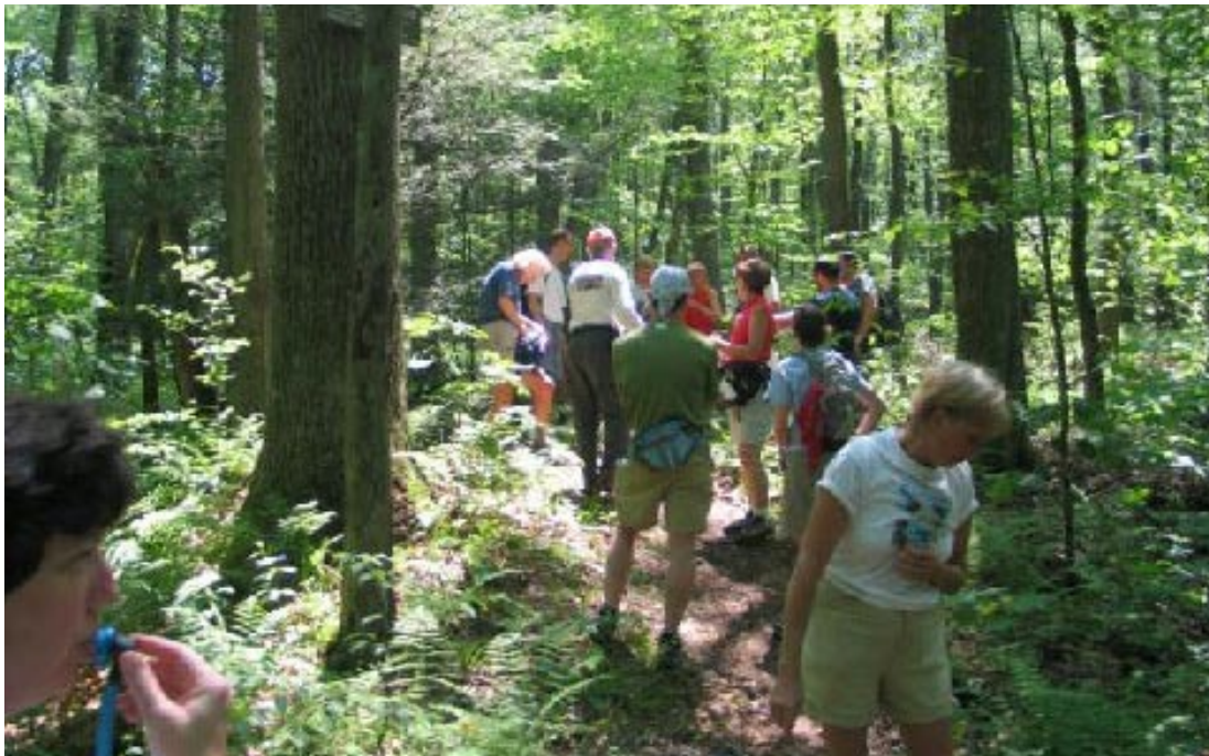
First hike on the newly dedicated trail