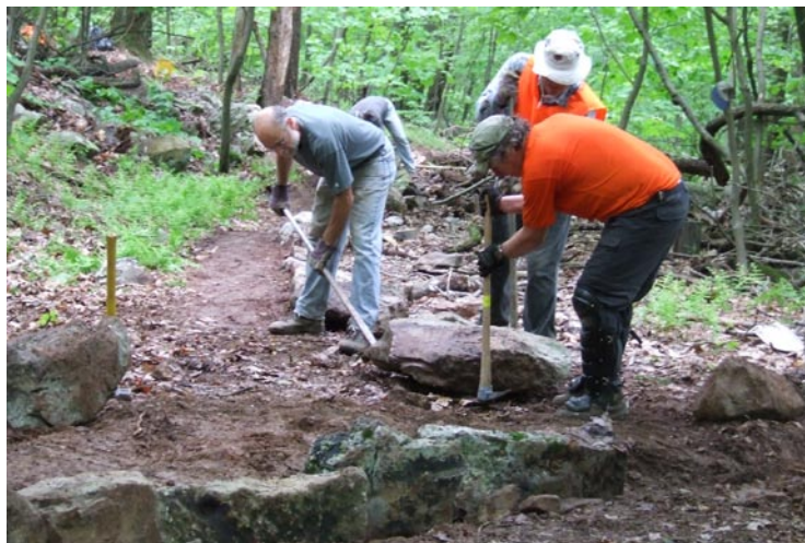
A little rock work