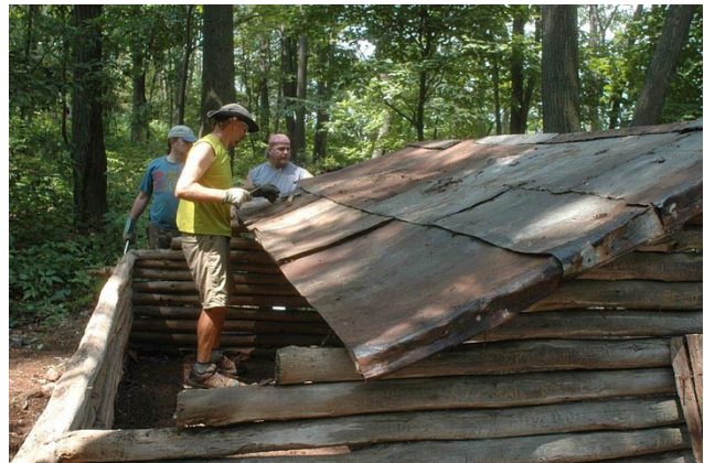
There goes the roof