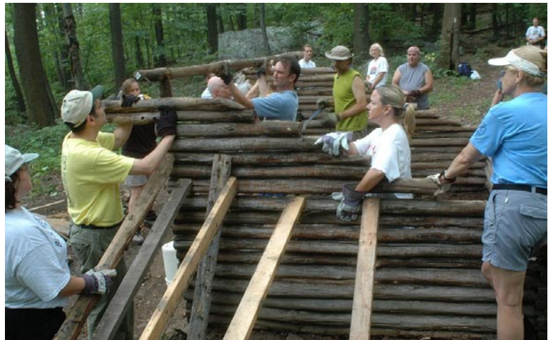
Photo by Charlie Duane August 2, 2008: Dismantling the shelter Earl Shaffer built in the 1960s