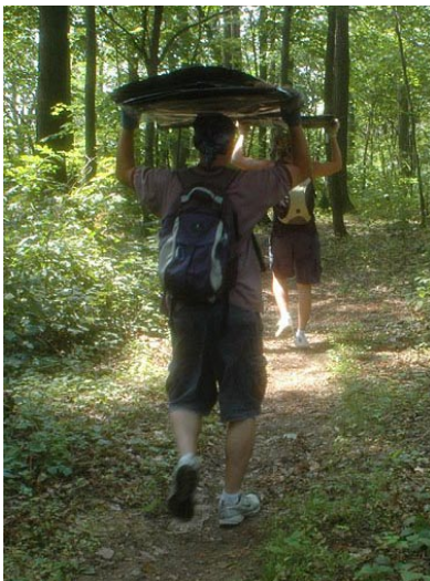
Carrying it out