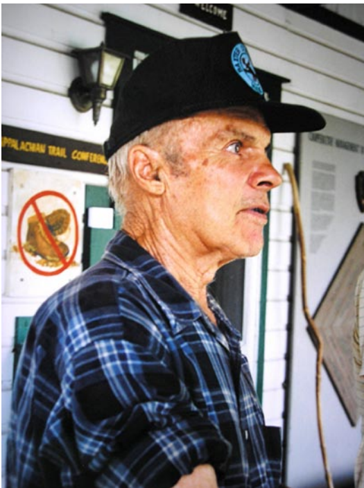
Earl Shaffer in 1999

This Edition is dedicated to the life of Earl Shaffer